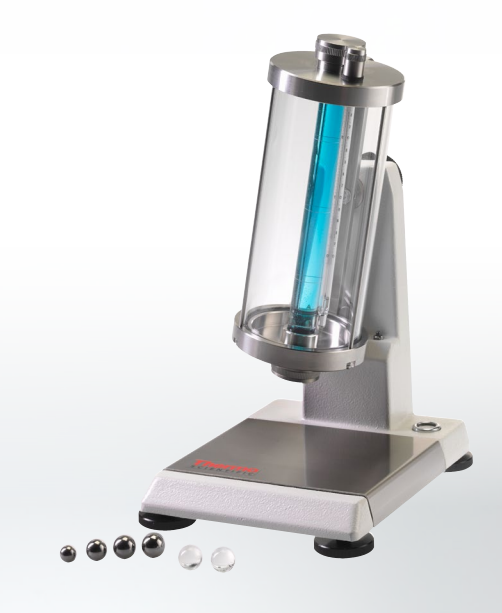
The HAAKE Falling Ball Viscometer Type C